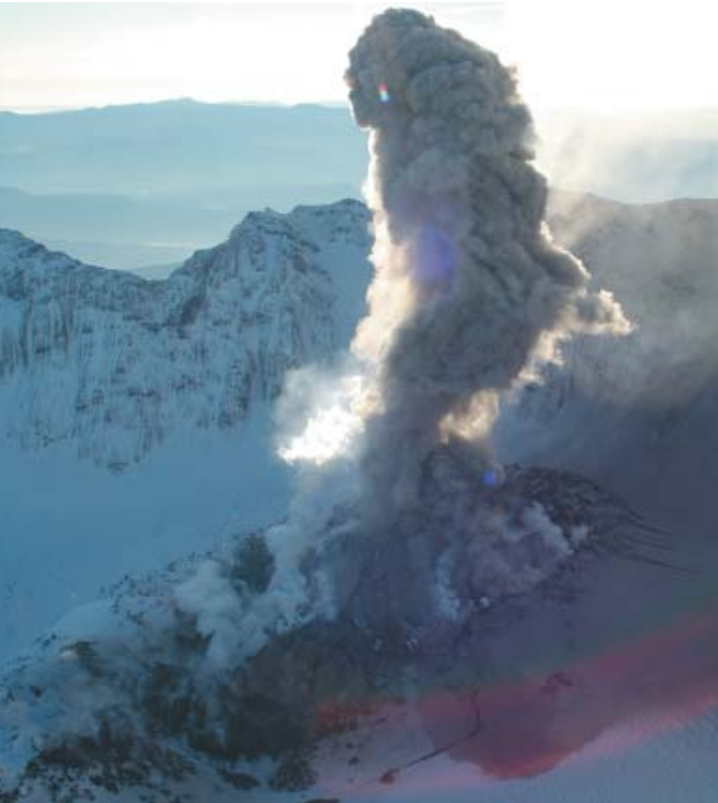
Mount Saint Helens, November 4, 2004, USGS photograph taken by Jim Valance and Matt Logan

Diseases spread by common vectors, such as West Nile Virus, reinforce the need for a public health education program in every community.