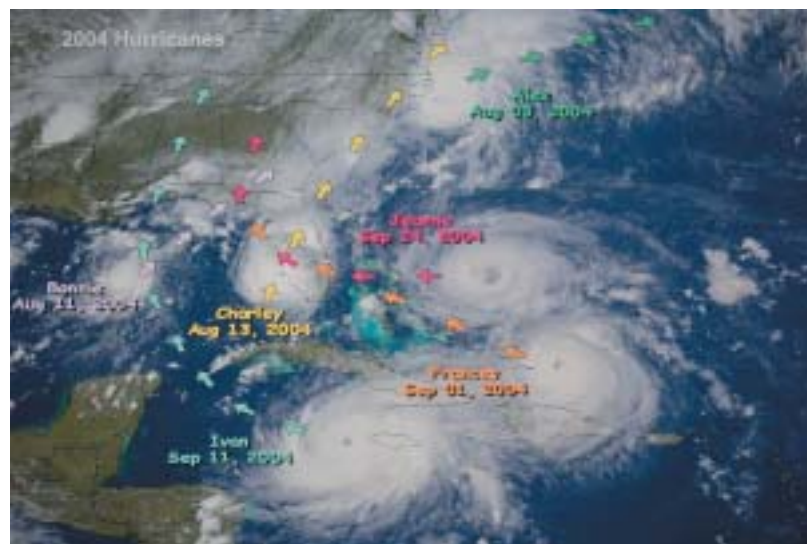
2004 Hurricane Season, The University of Wisconsin-Madison, Space Science and Engineering Center, November 30, 2004

To reduce the impact of ice storms, continuous and useful information about the hazard must be made available to everyone affected. Geographic information systems can be used to provide integrated weather information and road conditions. Identifying the effects of wind on ice-laden structures and trees, of low visibilities in blowing snow, and the impact on just-in-time transportation systems can inform mitigation efforts and reduce disruption.