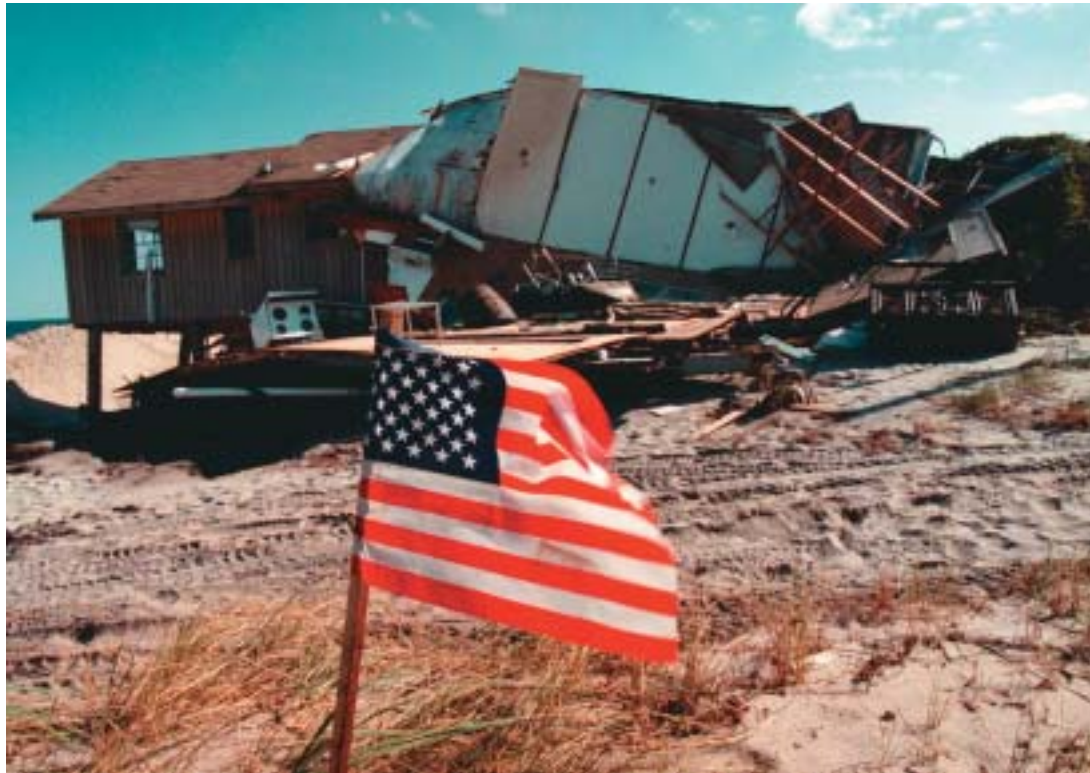
Aftermath of Hurricane Fran, September 1996

W e cannot avoid hazards, but we can act to minimize and reduce their impacts. After all, hazards do not become disasters unless the communities they touch are unprepared to deal with them. In short, disaster resilience must become inherent to our national culture and a natural right of all people. This report establishes a framework for Federal investment in science, engineering, and technology to reduce America's disaster vulnerability. Successfully reducing disasters depends upon sustained investment in these Grand Challenges and in recognizing that hazards are inherent on our complex environmental, constructed, agricultural, political, and social systems.